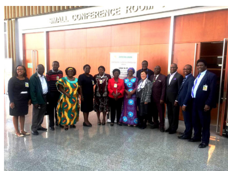
Cluster Coordinators group photo

platforms at all levels of the education system to promote access to quality education, research, knowledge creation and innovation to exploit digital technology. Also to Provide financial support for girls and women to pursue studies in STEM, and ensure implementation of accompanying measures that can provide girls and women with quality training in ICT, coaching, leadership and entrepreneurship. The key recommendations were adopted as the Lilongwe Declaration.