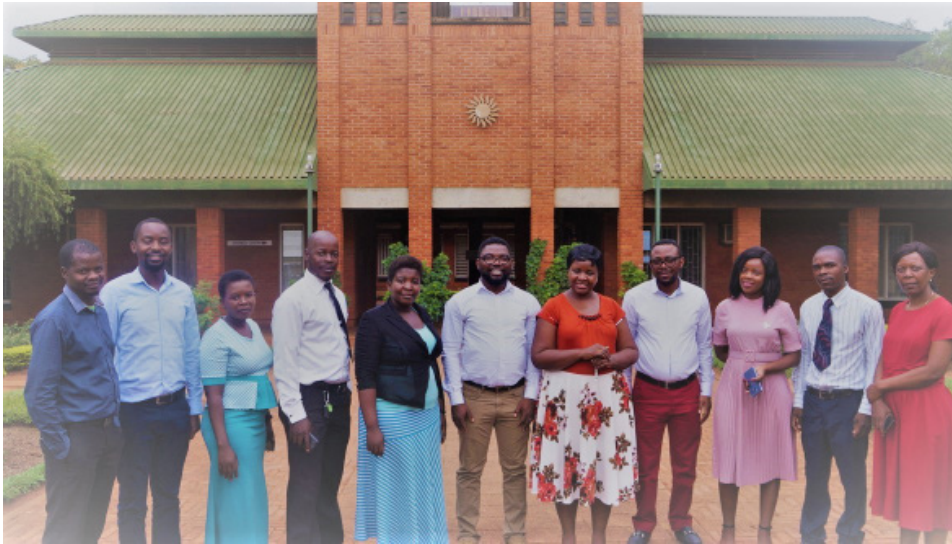
AUC Staff and Ministry Officials who participated in the pilot exercise