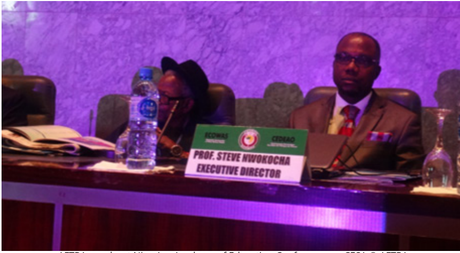
AFTRA speaks at Nigerian Academy of Education Conference on CESA