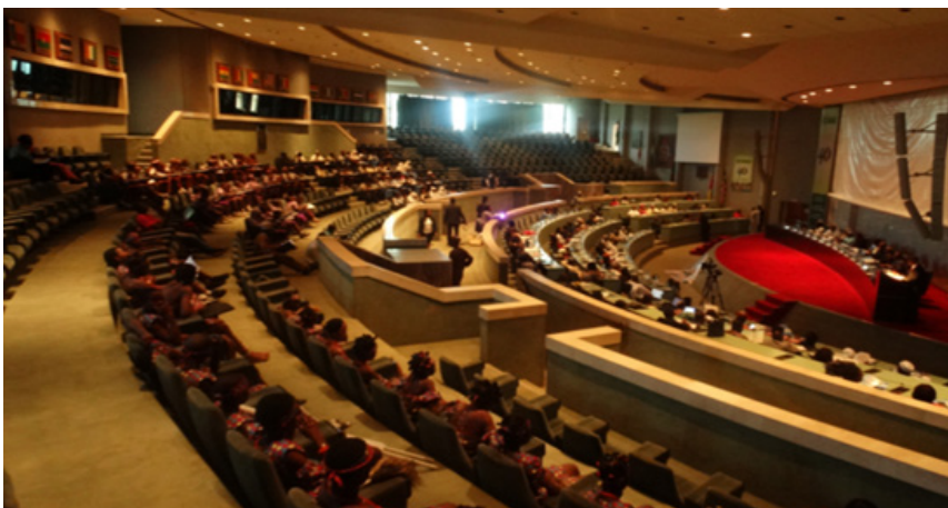
Participants at the conference in Abuja

Thus, the AFTRA Executive Director who was a Guest Speaker at the West African Conference of the Nigerian Academy of Education dedicated his presentation to CESA and the AU Agenda 2063: The Africa We Want. The Conference was hosted by the Economic Community of West African States (ECOWAS) and Officiated by the past President of ECOWAS and Nigeria's Minister of State for Education. There was also a diverse range of scholars from across West Africa. The presentation captured interest of the Academy which has now entered into official relationship with AFTRA. While the idea of a West African Academy of Education is now being discussed, it is believed that AFTRA will work with the Academies at the national and regional African levels to effectively contribute to the attainment of CESA goals.