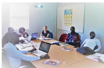
Previous IPED Data Collection Platform pilots in Namibia and Nairobi

Based on the presentations and discussions the key outcomes of the consultation included the following: The selected stakeholders took stock of the progress and lessons learned in establishing their refugee education programmes within the global and continental frameworks; The meeting provided an opportunity for the stakeholders to establish a coalition of partners, who will now focus on Refugee education systems development and management; Stakeholders agreed that the country reports on the progress made on AU agenda 2063 and SDG 4, should provide evidence and instrumental inputs to the overall CESA and SDG 4 reports on Education in Africa.