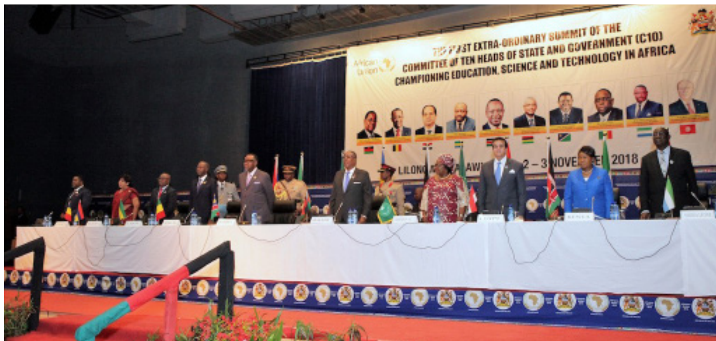
Commissioner for HRST and Heads of State and Ministers standing to the recitation of the AU anthem at the C10 Summit

The Committee of Ten Heads of State and Government (C10) Championing Education, Science, and Technology convened their First Extra-Ordinary Summit in Lilongwe, Malawi on 3rd November 2018 under the theme "Strengthening Education, Science, Technology and Innovation for