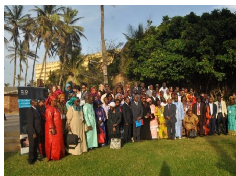
Participants of the training

CEMASTEА in partnership with MwalimuPlus implemented 'Ignite the learning' technological learning tool project in teaching primary mathematics.