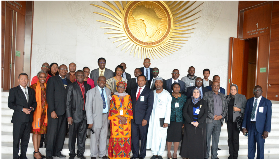
National and regional quality assurance and accreditation agency participants of the workshop