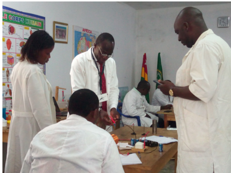
Teachers learning at the OPEM SSST