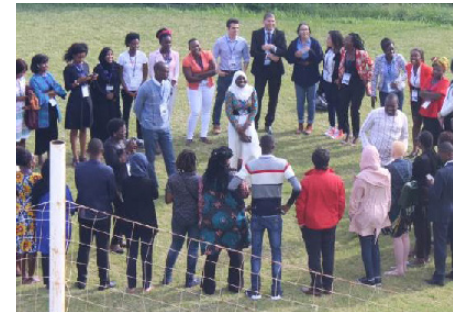
Capacity building exercise for girls

The 2nd Youth capacity building on Girls Education: Entrepreneurship, Coding and STIM took place from 20th to 23rd November 2018 and was attended