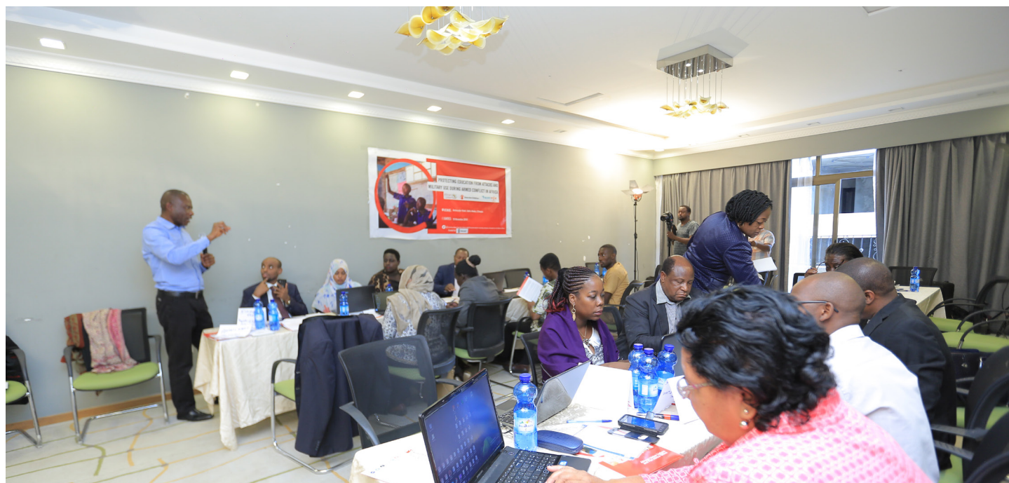
Ministry designates at the Education Policy Forum on Safe Schools in Addis Ababa

Delegates from eleven (11) African countries attended the Continental Education Strategy for Africa (CESA) Peace and Education Cluster workshop on Ensuring Safe Schools, which was held at the Ambassador Hotel Addis Ababa on 16th November, 2018. This workshop was co-hosted by the African Union