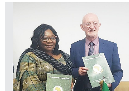
HRST Commissioner and CEO of GeSCI

The African Union Commission and GESCI (Global E-Schools and Communities Initiative) have agreed a programme of collaboration in relation