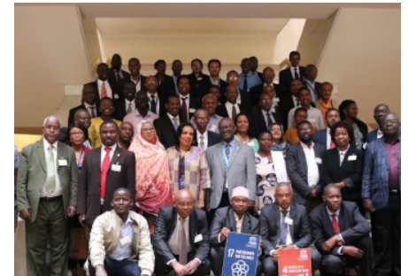
Participants of the workshop in Addis Ababa

Addis Ababa, Ethiopia 29th – 31st October, 2018: The objective of the workshop was to support different countries in the Eastern Economic