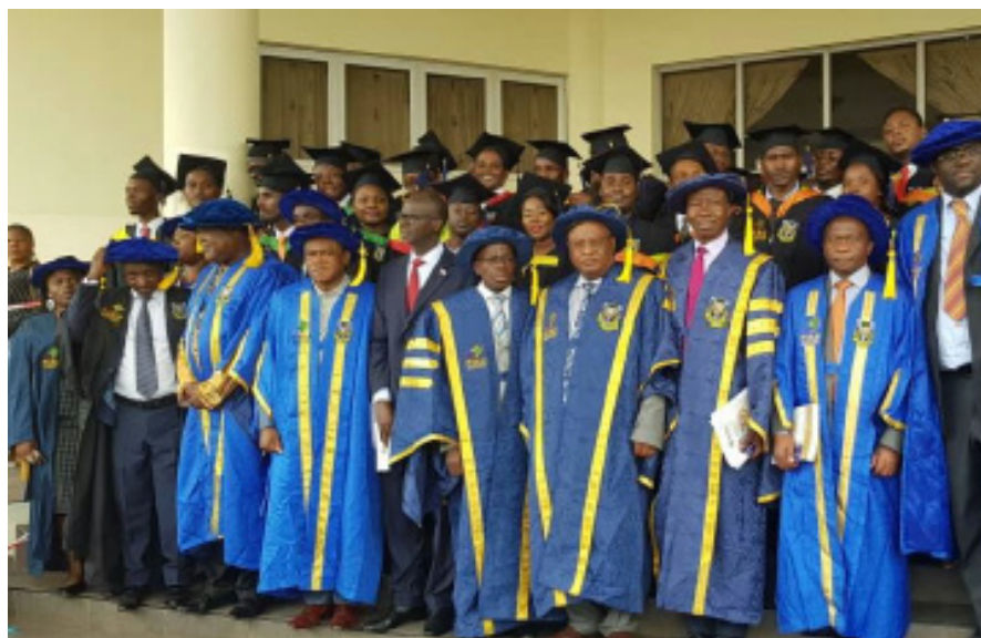
PAULESI Academic staff and graduating Master's and PhD students

UNESCO in collaboration with the South African Qualification Authority organized a Regional Consultation Meeting on Quality Assurance in Higher Education as part of preparations for the World Conference, from 20 – 21 November 2018 in Johannesburg, South Africa. The Forum provided opportunity for engaging Quality Assurance bodies and other stakeholders. Participants noted that there is need for effective networking of quality assurance and accreditation agencies at national, regional, and continental levels. The need to establish database of accredited higher education institutions and their programmes was stressed. The AUC-HRST representative provided the AU perspectives in promoting harmonisation of quality assurance mechanisms and practices at continental levels. It was suggested to convene a meeting on higher education involving ministries of education and national quality assurance agencies. The need to establish database of accredited higher education institutions and their programmes was stressed.