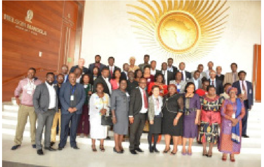
Participants of the CESA Curriculum Cluster Launch in Addis Ababa

Governments take ownership of national school feeding programmes and gradually provide sufficient and regular funds, from national budgets or other sources to reach all children and adolescents; Government and partners make deliberate efforts to promote local procurement to ensure school feeding serves as a market for smallholder farmers and for small food enterprises, benefiting local economies; Country-specific legal frameworks and comprehensive strategies for school feeding programmes are created and enabled; School feeding programmes have robust nation-led Monitoring & Evaluation (M&E) systems.