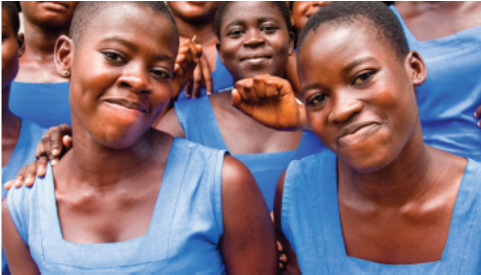
African Girls in School