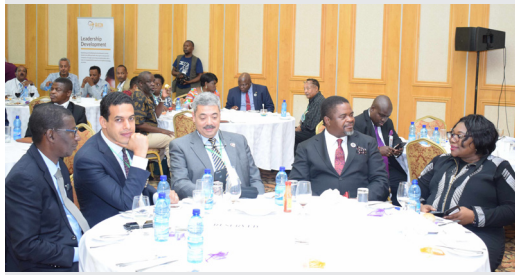
Commissioner for HRST and Ministers during AfECN hosted lunch at the C10 Summit in Lilongwe