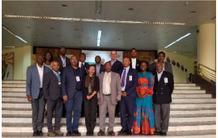
Participants of the PAU Research Validation Workshop in Addis Ababa

Participants were informed that HAQAA initiative provided four major outcomes: The development of African Standards and Guidelines for Quality Assurance; Provision of Training Course in QA for experts from 42 African countries; Institutional evaluations of 15 African higher education institutions, using the African Quality Rating Mechanism (AQRM); Consultancy visits and agency reviews to 8 countries in Africa to domesticate the African Standards and Guidelines for QA; It was agreed that first phase of HAQAA initiative is successfully implemented. The second phase is envisaged to be implemented from 2019 – 2022.