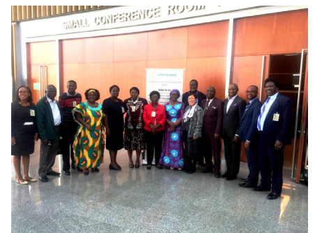
Cluster Coordinators meeting after Launch of Curriculum Cluster

implementation; Emphasise learner centered teaching and learning in order to unearth the creative and problem solving skills of children; Ensure reflection and consideration of the African society and context; Ensure inclusive curriculum, tailored to special needs learners and persons with disabilities; The Afri-centric curriculum is essentially curriculum that is guided by the Africa vision and aspirations, while incorporating African knowledge systems and cultures; The Cluster should help to establish a guiding framework for curriculum processes and products that will be domesticated by Member States; The need for a harmonized curriculum in Africa should be treated with the necessary sense of urgency it requires.