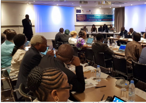
Participants at the HAQAA workshop in Dakar