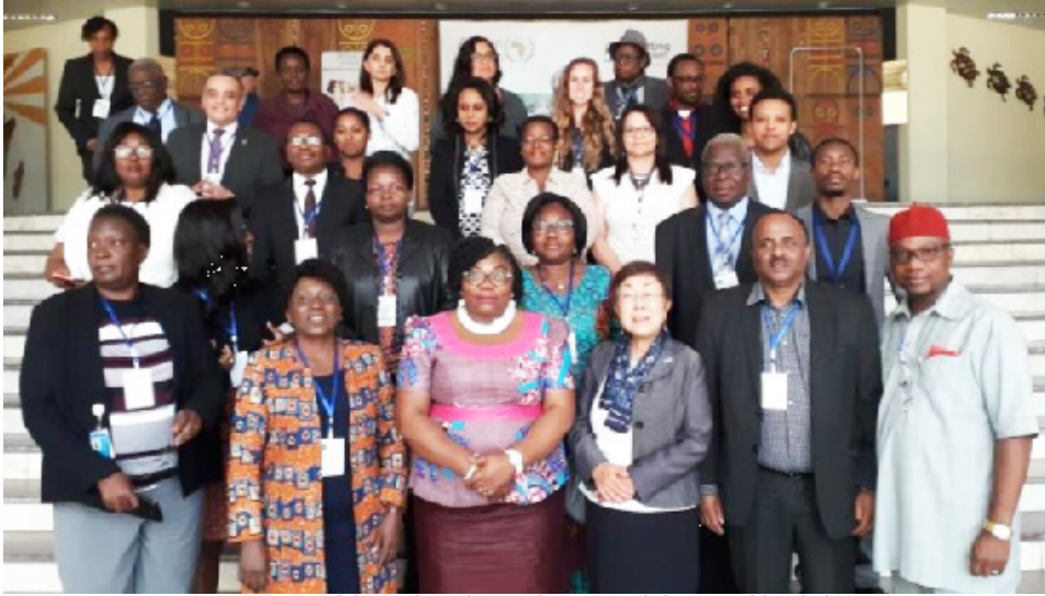
Participants of the Technical Consultation Workshop in Addis Ababa