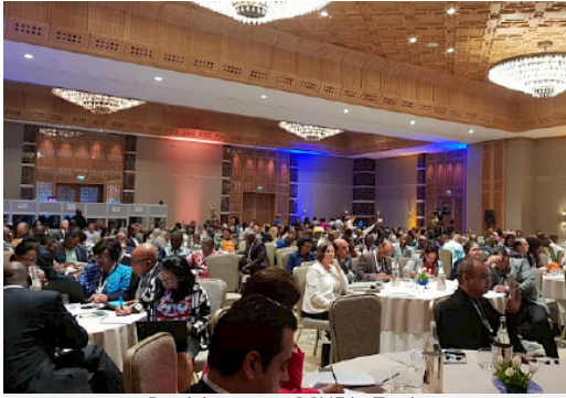
Participants at GCNF in Tunis