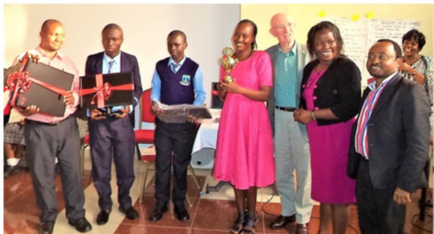
Participants at the leadership training and award ceremony in Kenya