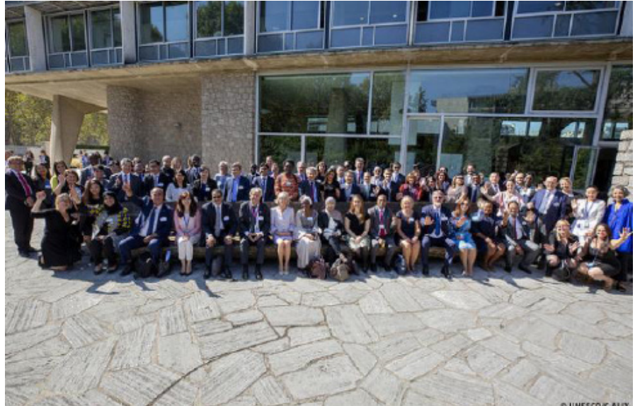
SDG Education 2030 Steering Committee

The key recommendation of the meeting were adopted as the “Brussels Declaration”.