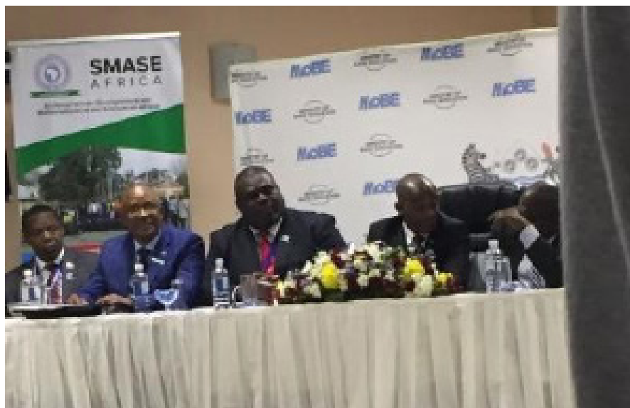
High level officials at the COMSTEDA 16 in Maun

Module 5: Computer skills to perform modern teaching in Africa. Microsoft office tools easy for teachers; Module 6: Implementation of Sciences and Technology - Coding and automation.