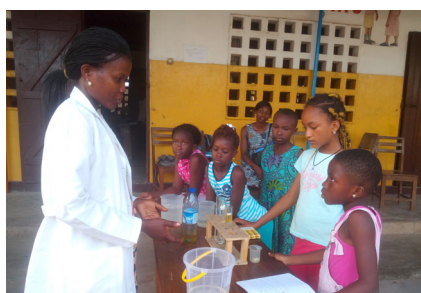
OPEM Facilitator engaging children in practicing science experiments

Observatoire Panafricain pour l'Ecole et les Métiers (OPEM) is helping children to become creators and innovators towards industrial development of Africa as aspired in the AU Agenda 2063 - The Africa We Want. Since December 2018, OPEM is setting up Physics, Chemistry and ICT practice labs for children.