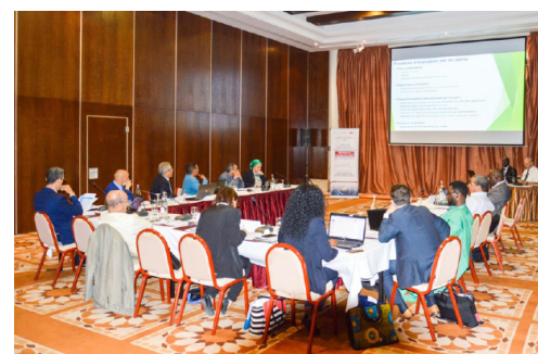
Participants of the workshop in Tunisia

In 2018, a workshop on the Development and Technical Validation of EMIS Norms and Standards for North Africa was held in the Republic of Tunisia from 18th to 22nd June 2018. The existing EMIS Norms and Standards Assessment Framework has been adapted to the context of Morocco and Egypt and modified to respond to SDG4 and CESA 16-25. ADEA also successfully conducted EMIS peer reviews in Angola and The Gambia in May 2018.