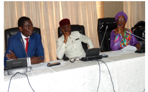
Ministers and AU Head of Education