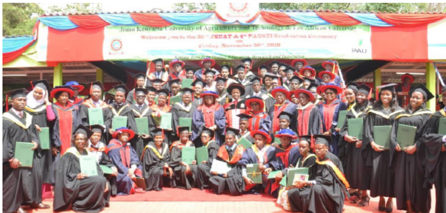
Master's and PhD graduands of the Pan African University, Institute for Basic Sciences, Technology and Innovation (PAUSTI) in Juja

Juja, Kenya: On 30 November 2018, the Pan African University, Institute for Basic Sciences, Technology and Innovation (PAUSTI) organized the graduation ceremony of its 4th batch of Master of Science and 2nd batch of PhD students at the Graduation Square of the Jomo Kenyatta University of Agriculture and