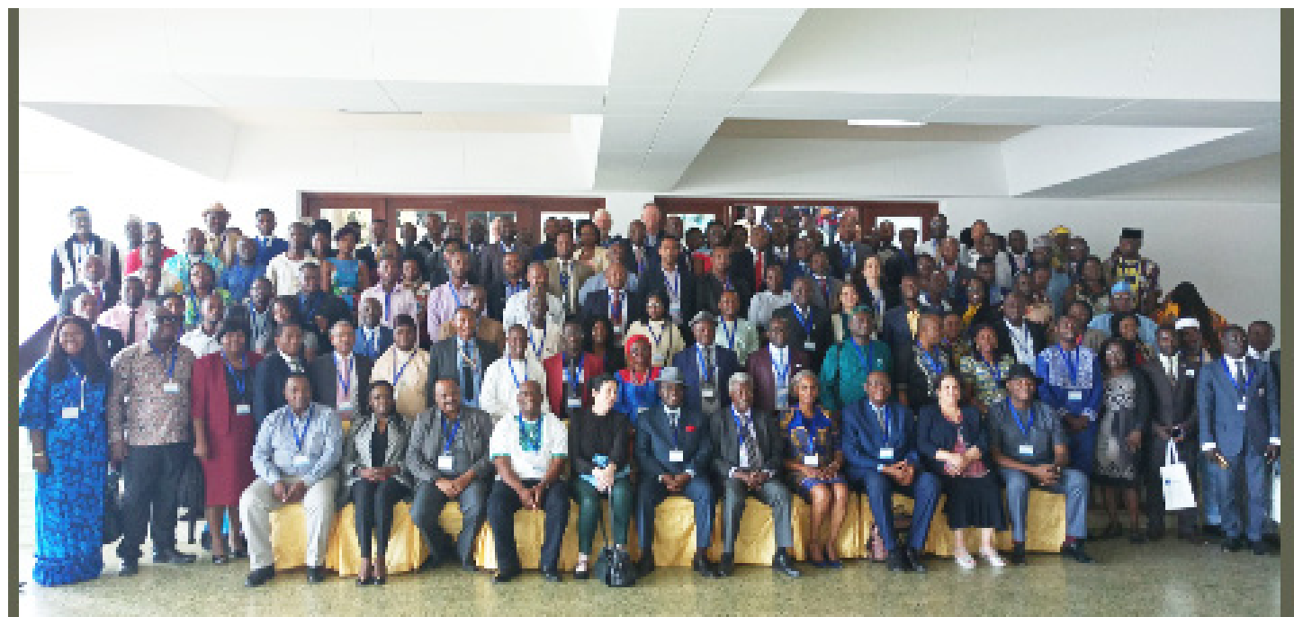
Participants of the 10th International Conferences on Quality Assurance in Higher Education in Africa (ICQAHEA) in Yaounde

The 10th in the series of International Conferences on Quality Assurance in Higher Education in Africa (ICQAHEA) was organised in Yaoundé, Cameroon on September 17-22, 2018. Four professionally-enriching events were bundled into the conference package. These are (a) the main conference; (b)