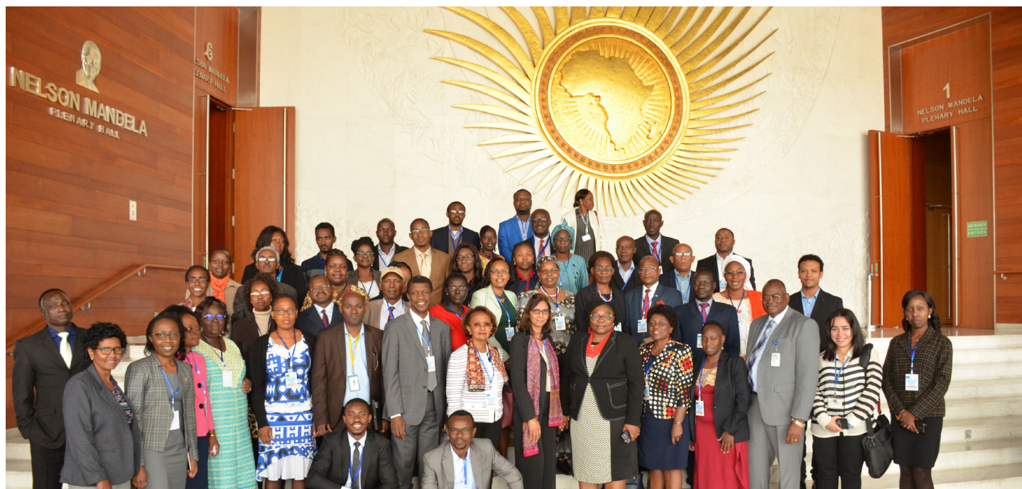
Participating AU Member States, RECs and Partners in ECED during the launch of the CESA Early Childhood Education and Development (ECED) Cluster Launch

Launch of the ECED Cluster, Addis Ababa Ethiopia, 3-4 September 2018. At the meeting, participating AU Member States, RECs and ECED partners presented ECED progress and the contributions they would like to make to ensure successful cluster engagement. During the meeting, the terms of reference, work plan and