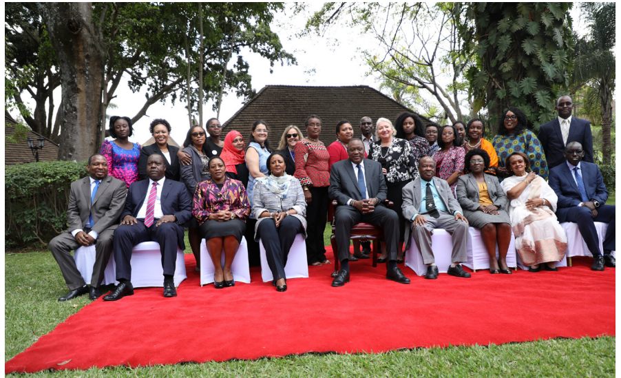
AfECN regional fraternity regional with H.E. President Uhuru Kenyatta who officiated the First International Conference on ECD in Nairobi

Government ministers, in presenting their recommendations to the C10, also presented key messages on the importance of the early years. The Ministers called for inclusive and equitable access to education at all levels and emphasized the importance of laying a strong foundation for learning and increased resource allocation.