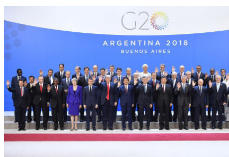
Participants of the G20 Leaders' Summit in Buenos Aires

development of ECED included: Promote comprehensive programming as the first 1000 days of life are critical in laying a strong foundation for successful lifelong learning; Maintain a focus on the holistic view of development; strengthen multisectoral collaboration at regional level and advocate for enhanced national multi-sectoral coordination; Emphasize the important role played by parents and other caregivers as the first teachers in the life of the child; Intensify action for better working conditions for the ECED workforce.