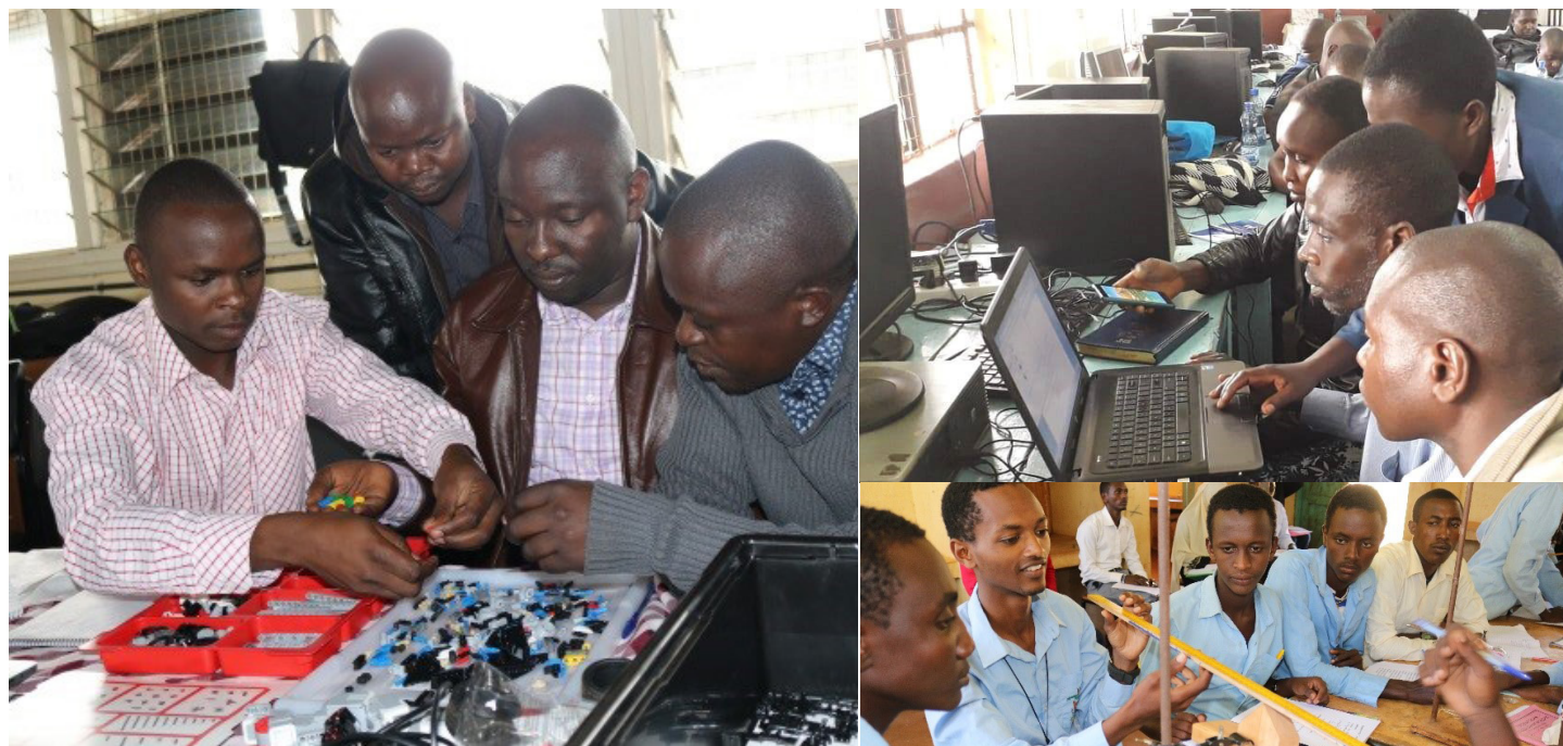
Robotics training, ICT integration and Lesson study exercises organised by CEMASTEА

The Ministry of Education first launched the STEM education project in Kenya on 2nd September, 2016. CEMASTEА was mandated to implement STEM Model school Program in 102 selected secondary schools spread across the country. The aim of the program is to motivate and inspire students to excel