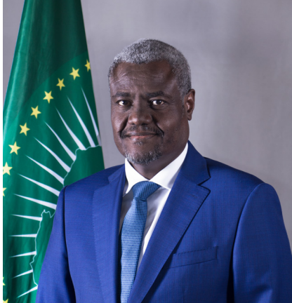
H.E. Mr. Moussa Faki Mahamat Chairperson, AUC