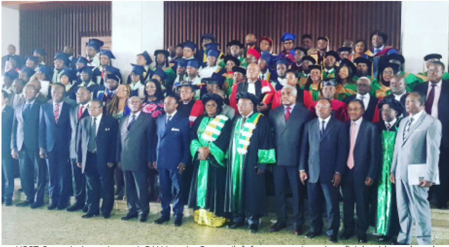
HRST Commissioner (center), PAU Interim Rector (left from center), senior officials with graduands