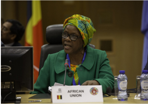
Head of Education makes presentation