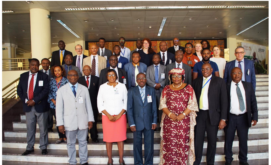
Pan African University Council