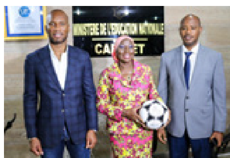
Drogba with representatives of ADEA and MoE, Côte d'Ivoire

GESCI (Global eSchools and Communities Initiative), in close partnership with the Ministry of National Education and Technical Training of Côte d'Ivoire, held a progressive event for 20 Secondary Schools in the regions of Abidjan and Yamoussoukro.