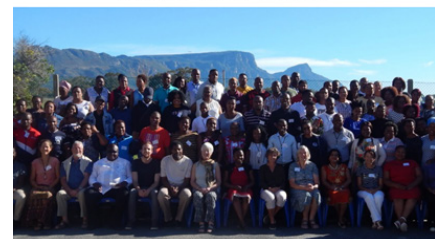
Participants at the Mathematical Thinking (MT) Course held in Cape Town, South Africa