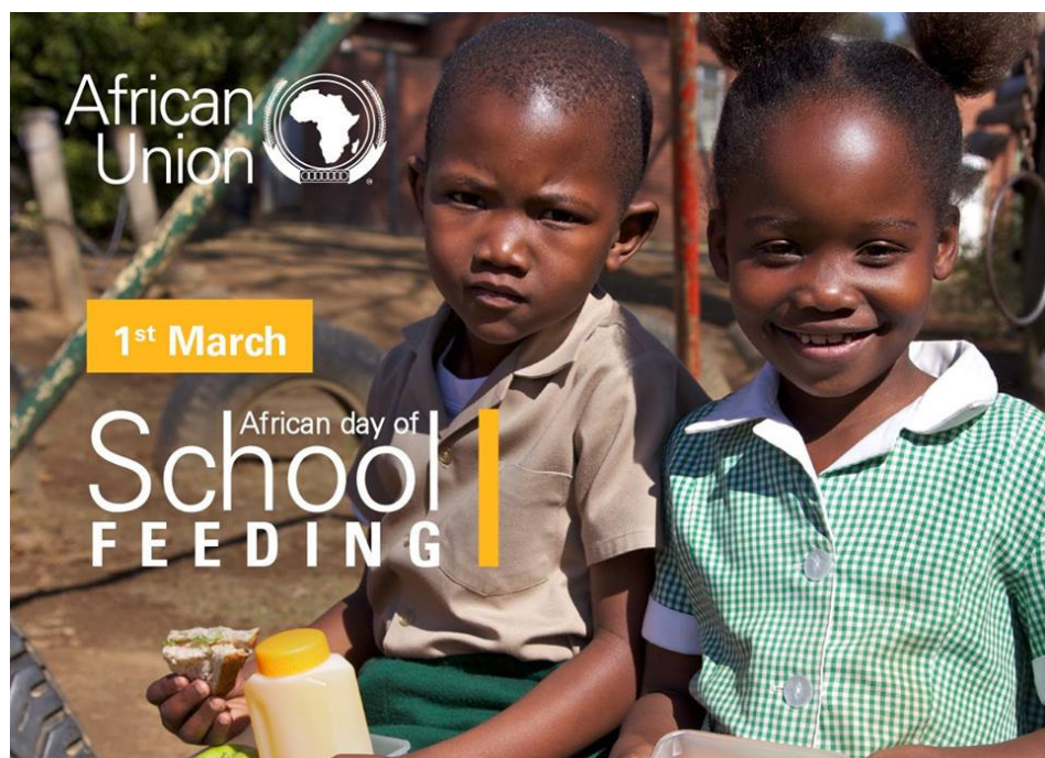
4th Africa Day of School Feeding Poster

Investing In Home Grown School Feeding For Achieving Zero Hunger, Sustaining Inclusive Education For All Including Refugees And Displaced Persons In Africa