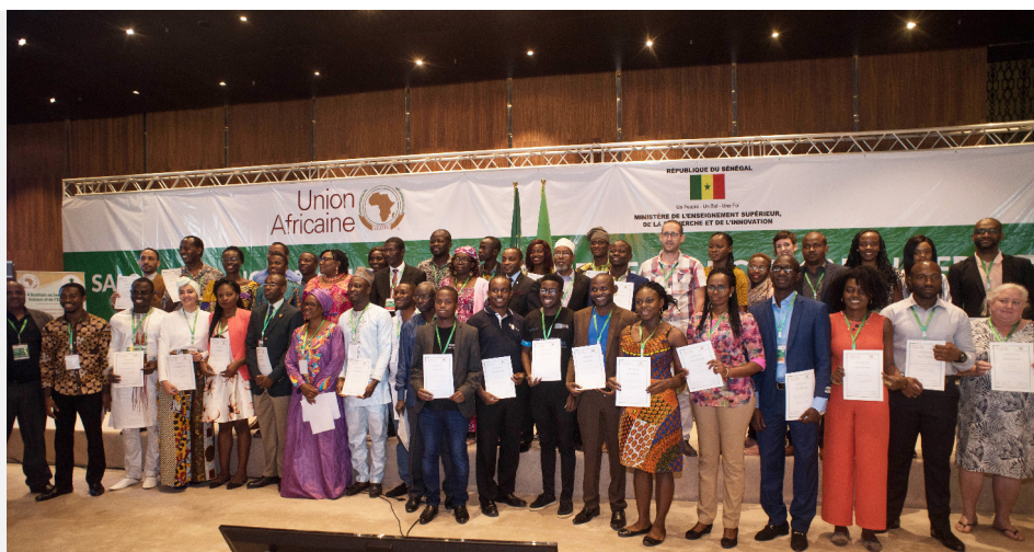
Innovators pose with certificates at the Innovating Education in Africa Expo 2018

school graduates will have access to tertiary education with 70 per cent of them graduating in the sciences, technology and innovation programmes. The challenges of achieving the education and skills revolution called for by Agenda 2063 are immense. We therefore cannot afford to be sidetracked by other people's visions, but we continue to seek out and engage with those of a compatible and complementary outlook.