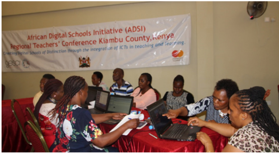
Teachers in Kiambu County during Training