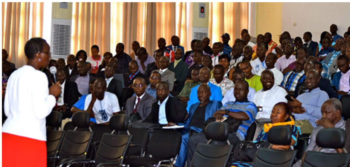
Teachers from Abidjan and Yamoussoukro regions in Cote d'Ivoire during the certification ceremony

The Ministry of National Education and TVET, Republic of Côte d'Ivoire, in partnership with GESCI (Global eSchools and Communities' Initiative) marked the first phase of Ecole Numérique d'Excellence Africaine (ENEA) (African Digital Schools Initiative (ADSI). Some 141 key secondary teachers from Abidjan