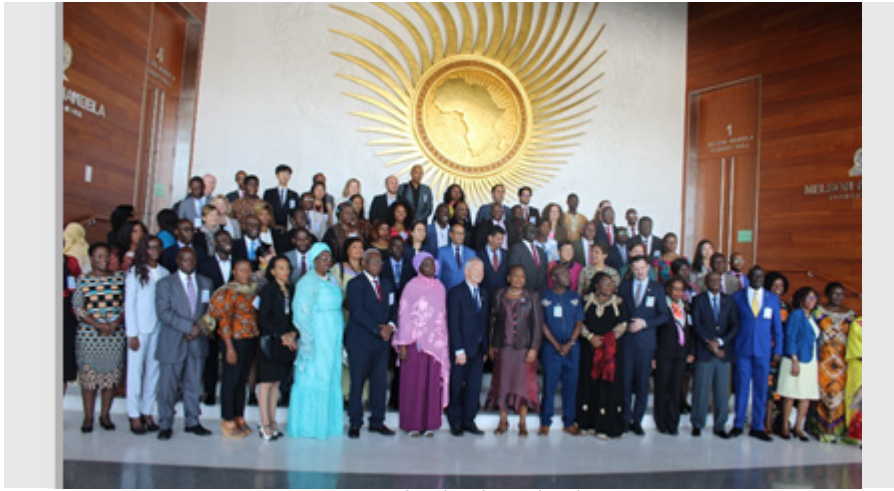
Participants of 3rd High Level Dialogue