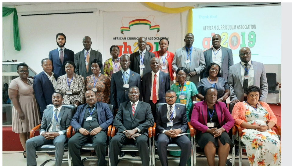
Deputy Minister of Education with Participants from AUC, ACA and other partners