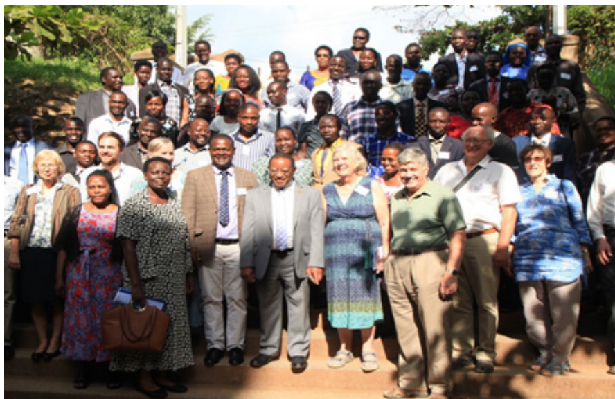
Participants at the Professional Development session

Established the coordinating framework of the cluster on Life Skills Education and Career Guidance; Shared understanding of cluster objectives among its membership; Defined the operational objectives and biennial interventions of the cluster; and Identified sub cluster members.