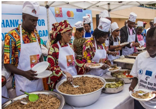
First Lady serves lunch to children