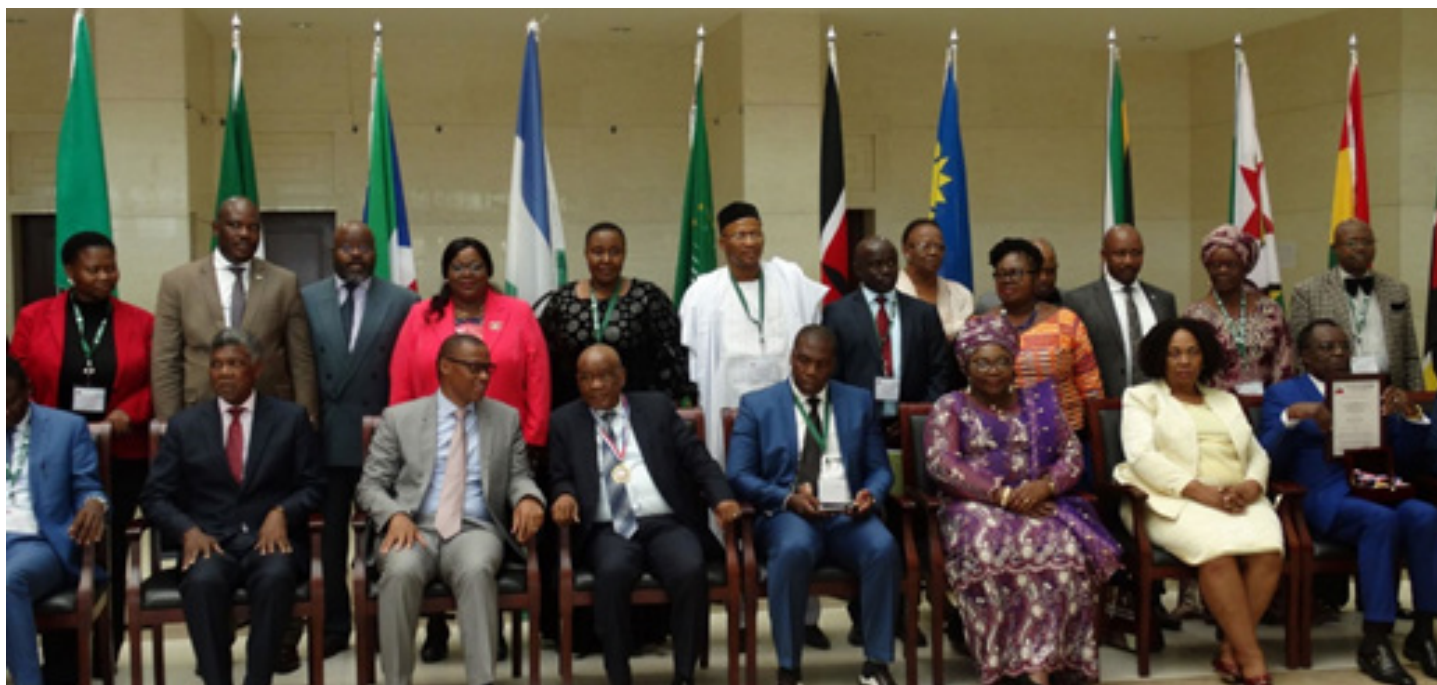
Line-up of dignitaries at the AFTRA Anniversary and Conference – the Prime Minister of Lesotho, Ministers of Education, H.E. Commissioner of HRST AUC, AFTRA

AFTRA celebrated its 10th Anniversary to mark its inauguration in Abuja, in 2010 by the Ministers of Education. It further held its 8th International Teaching and Learning in Africa Conference and 10th Roundtable, May 13-18, 2019. All the