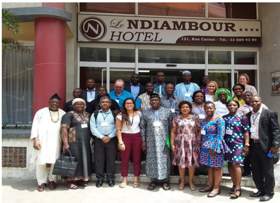
Participants of the Roundtable

ANCEFA, in partnership with Oxfam IBIS, is implementing the Youth Education for active citizenship and Gender equality (YEG) project in West Africa and Sahel region. The project runs from 2018 – 2021 with the first phase (first two years) involving 3 countries (Sierra Leone, Burkina Faso, and Ghana), afterwards it will be decided if three more countries, Mali, Niger, and Liberia should be involved as well. Country level interventions are managed by Oxfam country offices in the respective countries. The main objective of the