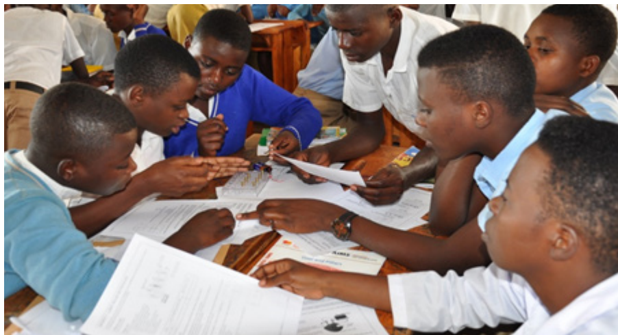
Students using the UNESCO micro-science kits