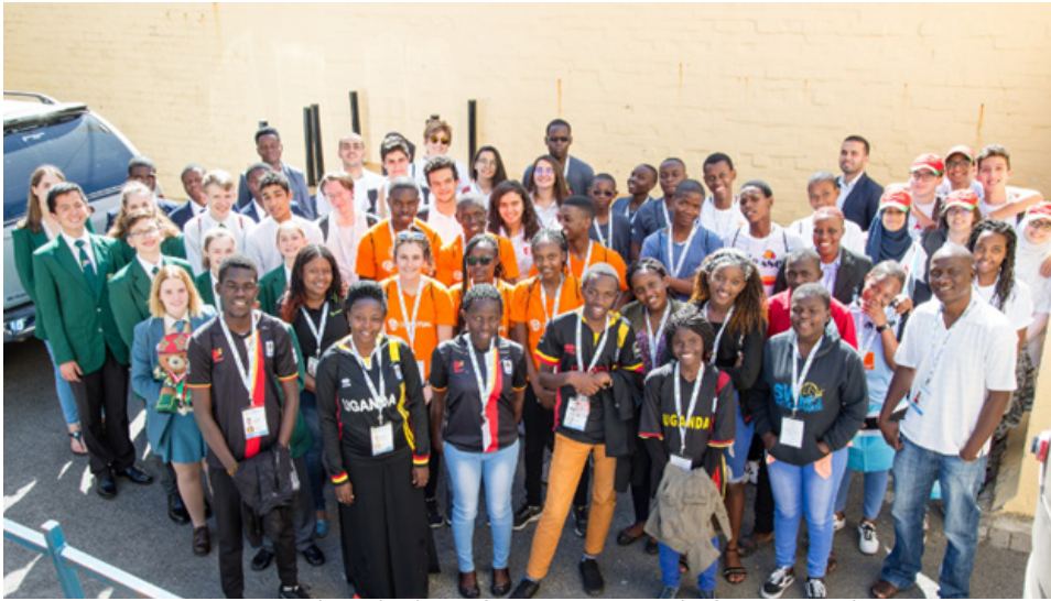
Participants at the 27th Edition of PAMO at AIMS South Africa in Muizenberg