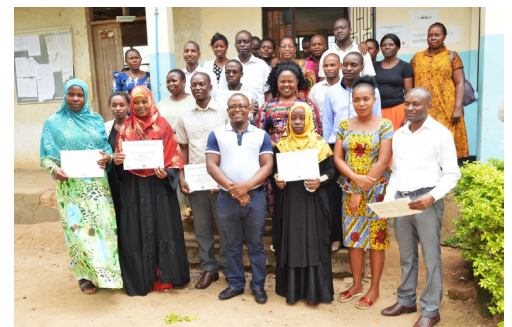
Teachers of Tushikamane Secondary School in Morogoro, Tanzania, One of the schools implementing ADSI.

In Tanzania, in its second year of implementation, more than 400 teachers from the Morogoro and Pwani regions have completed Technology Literacy training and have been awarded certificates. The teachers are currently midway through the Knowledge Deepening modules. Some 40 secondary schools have achieved the e-Enabled level and are currently working towards e-Confident status.