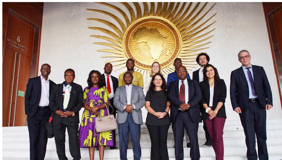
Participants of the First PAU Workshop on Communication Strategy